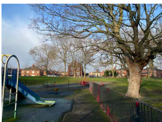
Play area is dated and some pieces are broken. Over hanging trees contribute to the poor state of the area. However, the large area allows opportunity for an exciting new neighbourhood playground.