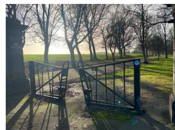
Entrances not DDA compliant. Unattractive fences around boundaries and access points do not feel welcoming and don't fit with traditional stone piers.