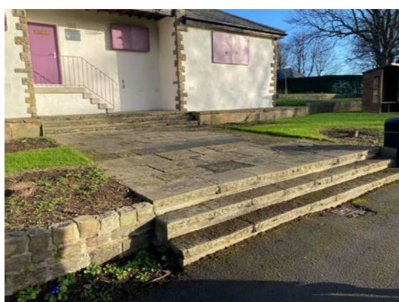
Well used community bowling green, but club building in need for new frontage including refurbishment of retaining wall, steps, ramps and flowerbeds.