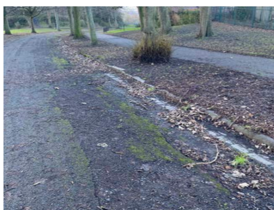
Park Parade is in need of resurfacing. Material and width to be maintained for walking and cycling club along with events.