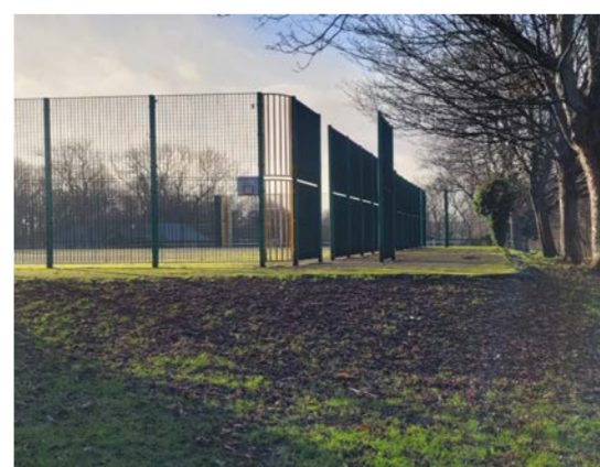
No connecting paths from main circular path causing wear and obvious desire lines. DDA compliant paths and ramps to be introduced.